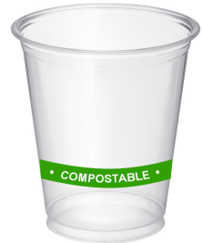
PLA cold cup