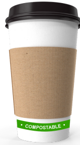
Paper cup lined with PLA